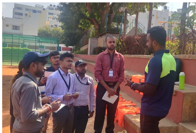
With Tenvic, Bangalore