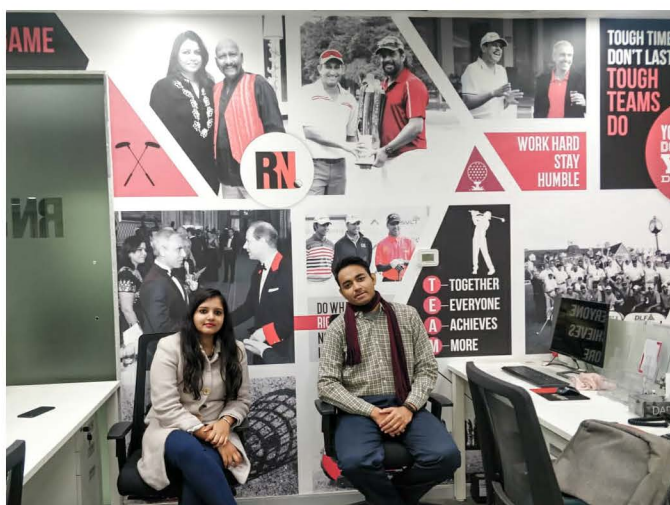
With RN Sports Marketing, Gurugram