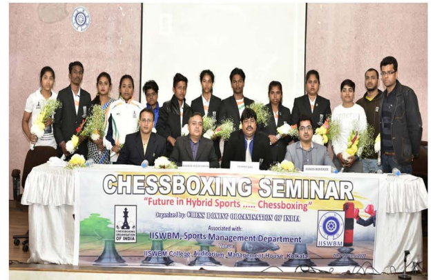
Department organised a seminar on the promotion and development of Chessboxing