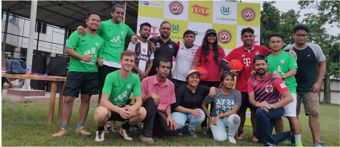
In an event of the German Football Academy