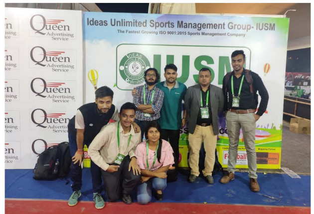
At Fit Expo 2