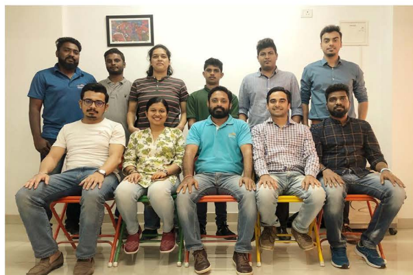
With Sportify, Bangalore