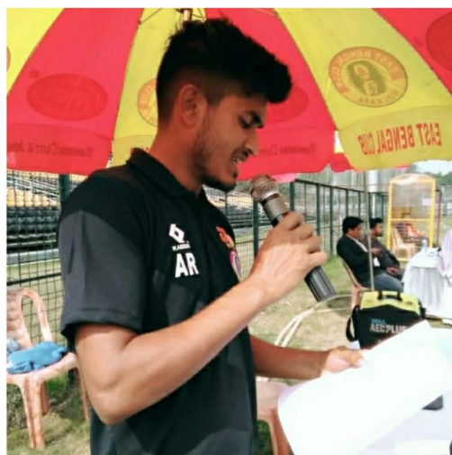
With Quess East Bengal, Kolkata