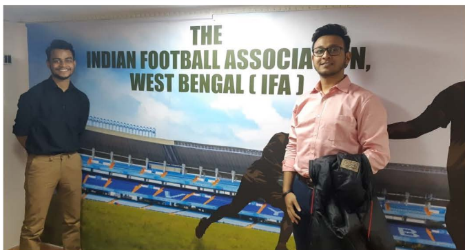
With Indian Football Association, Kolkata