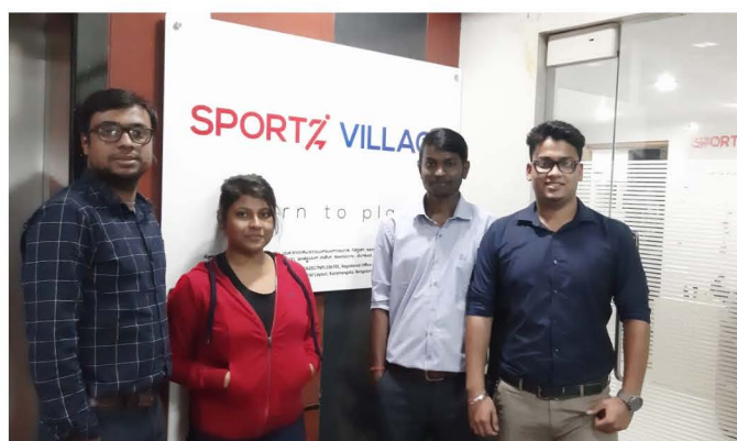
With Sportz Village Bangalore