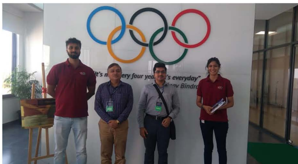
Faculty Members of the Sports Management Department at the Padukone-Dravid Centre for Sports Excellence