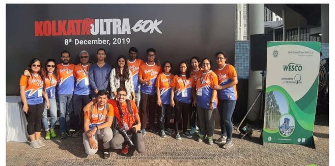
Some of our students at the Ultra Marathon Race