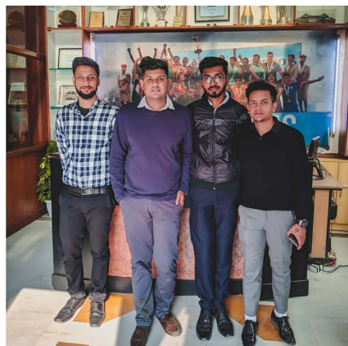
With the All India Football Federation (AIFF), Delhi