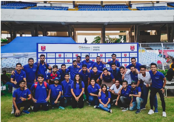
In an event of Reliance Foundation Youth Sports