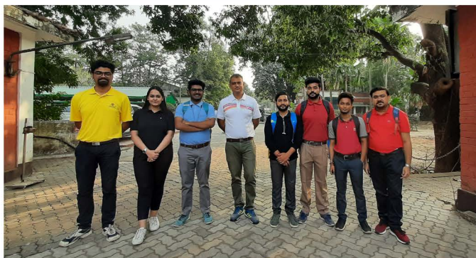
With Protouch Golf Academy, Kolkata