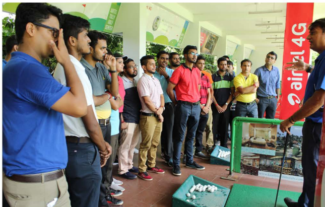
At the Golf Academy