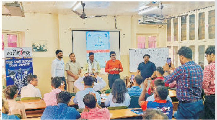
Sports Management students at the Tata Sports Complex