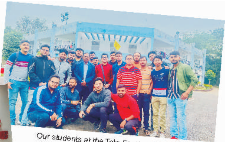
Our students at the Tata Football Academy