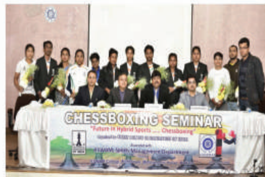
Department organised a seminar on the promotion and development of Chessboxing