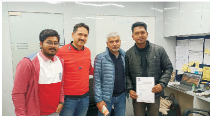
With Gallant Sports and Infra, Delhi