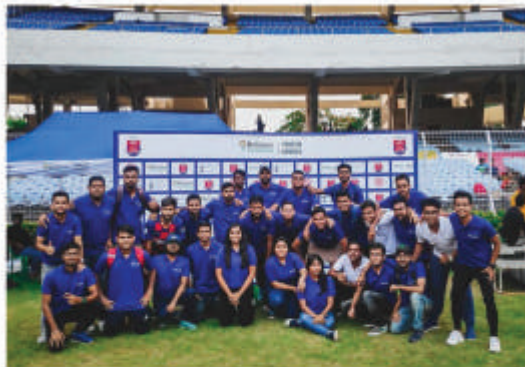
In an event of Reliance Foundation Youth Sports