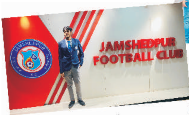
Our student at the Jamshedpur Football Club