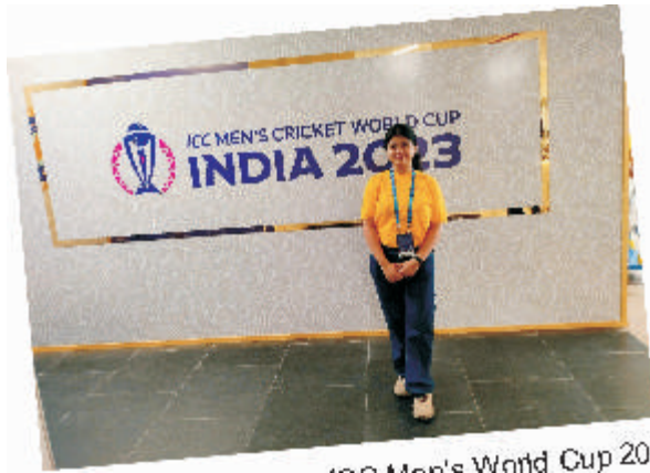
Our student working in the ICC Men's World Cup 2023