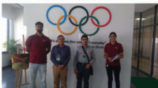
Faculty Members of the Sports Management Department at the Padukone-Dravid Centre for Sports Excellence, Bengaluru