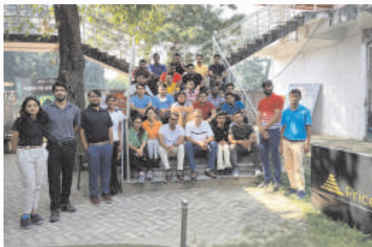
At the Protouch Golf Academy