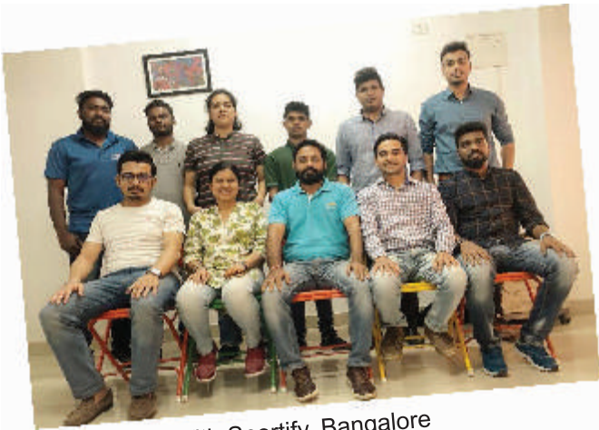
With Sportify, Bangalore