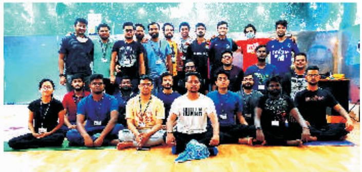
At the Mantra Health Club