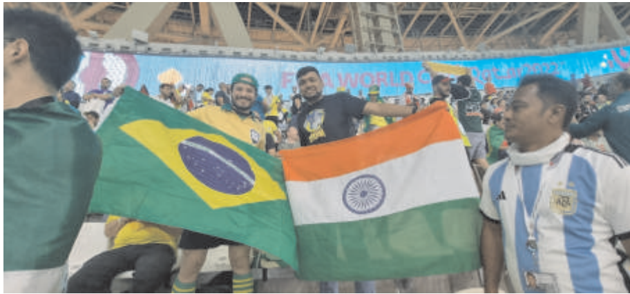
Sports Management student at the Qatar Football World Cup