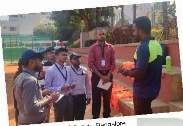
With Tenvic, Bangalore