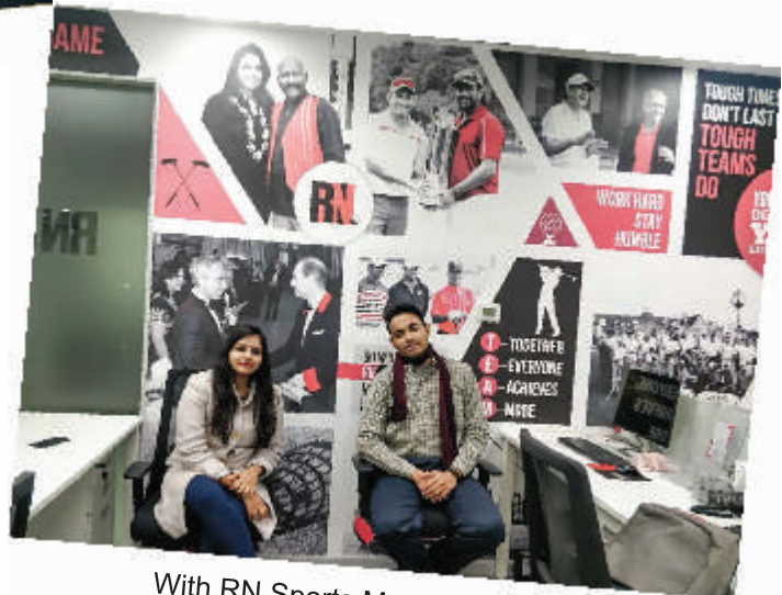
With RN Sports Marketing, Gurugram