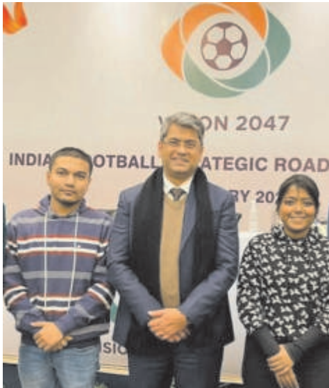
With the President of the All India Football Federation