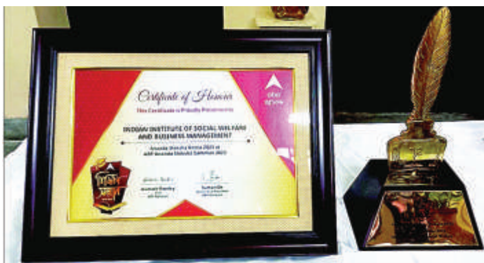
IISWBM has been recently awarded the Ananda Shiksha Ratna Award 2023 by the ABP Group.