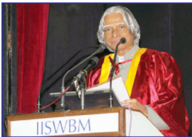
Dr. A.P.J. Abdul Kalam the then President of India addressing the Institute's Convocation 2006