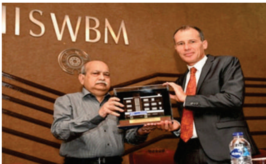
Memorandum of Understanding between Moscow State Linguistic University, Moscow, Russia and IISWBM, Kolkata was signed on 1st June, 2023