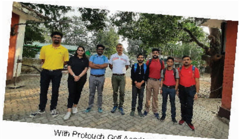
With Protouch Golf Academy, Kolkata