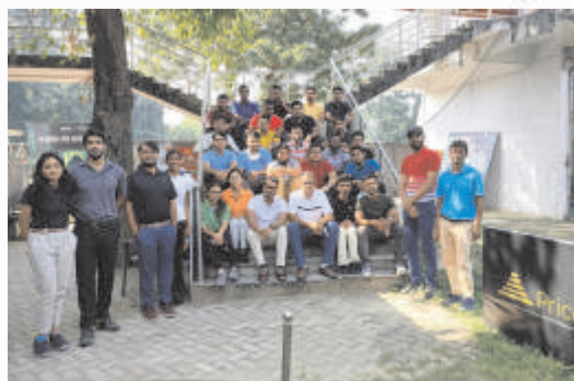
At the Protouch Golf Academy