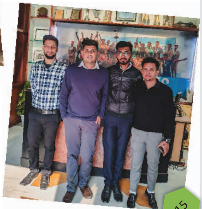
With the All India Football Federation (AIFF), Delhi