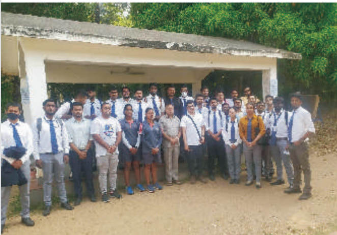
Sports Management students at the Tata Sports Complex