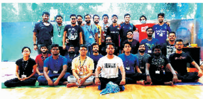
At the Mantra Health Club