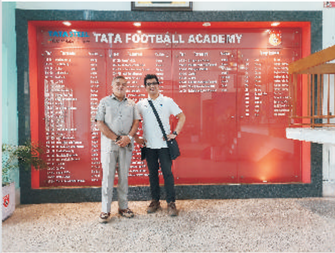
Faculty Members of the Sports Management Department at the Tata Football Academy