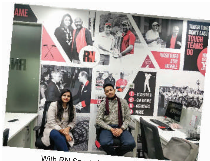
With RN Sports Marketing, Gurugram