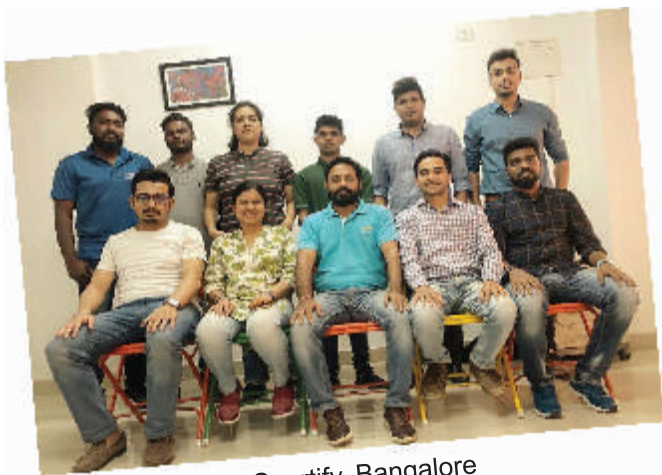
With Sportify, Bangalore