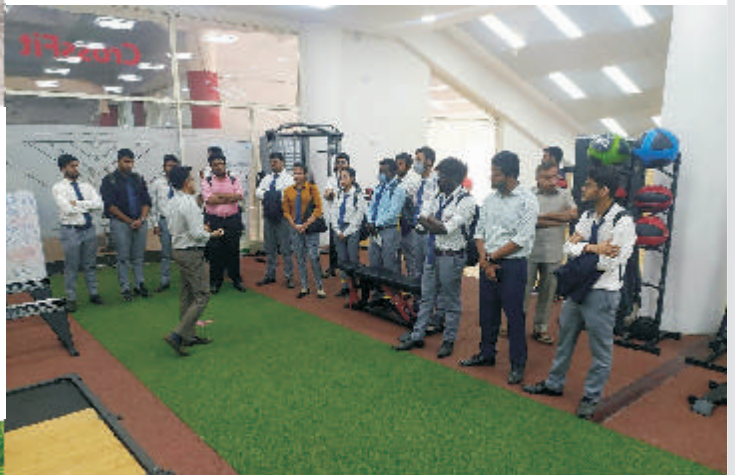
Sports Management students at the High Performance Centre of Sports