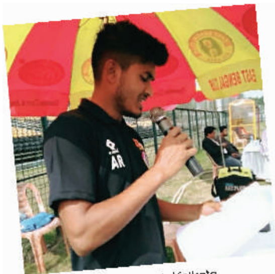
With East Bengal, Kolkata