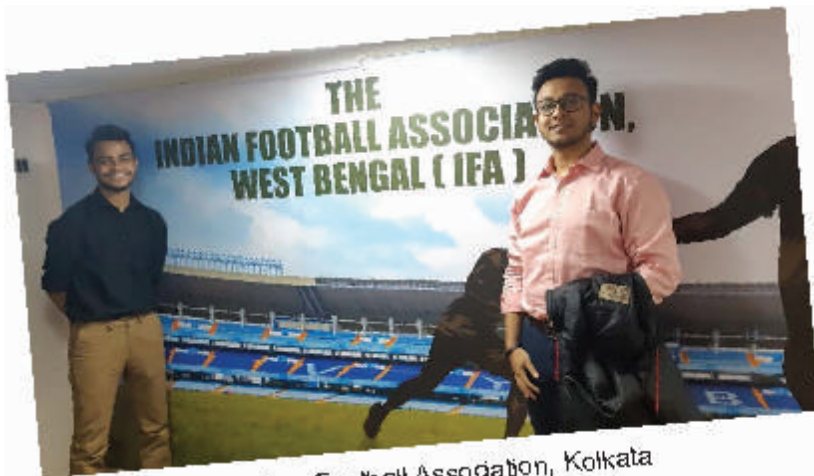
With Indian Football Association, Kolkata