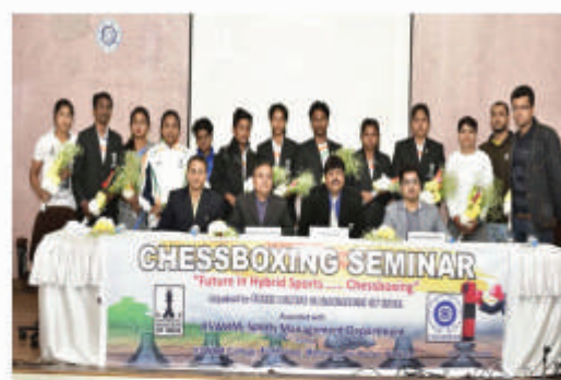
Department organised a seminar on the promotion and development of Chessboxing