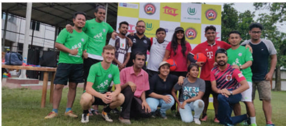
In an event of the German Football Academy