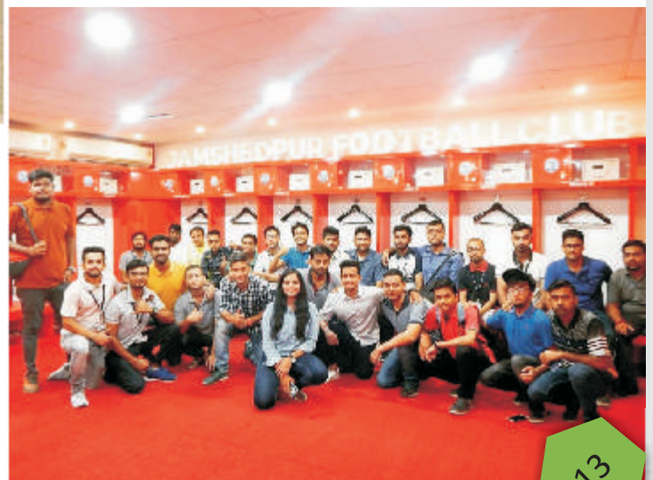
Sports Management students at the Jamshedpur FC