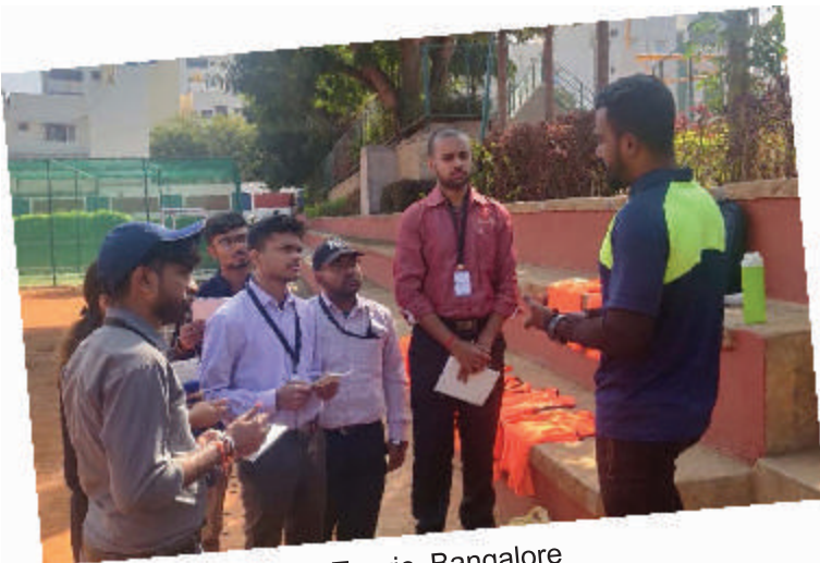
With Tenvic, Bangalore