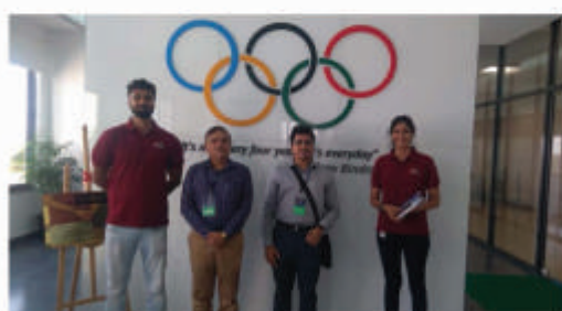
Faculty Members of the Sports Management Department at the Padukone-Dravid Centre for Sports Excellence