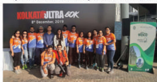
Some of our students at the Ultra Marathon Race