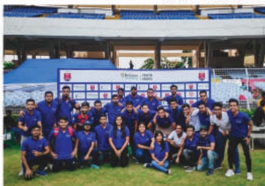
In an event of Reliance Foundation Youth Sports