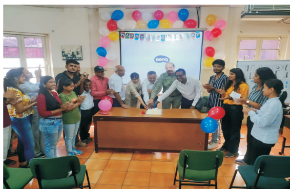
Teachers Day Celebration in the classroom - 2024