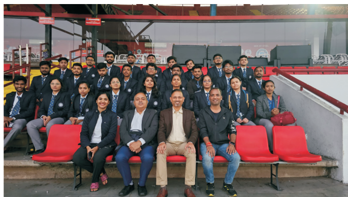
Sports Management students at the Tata Sports Complex with the Head of the Department and the Chief of Tata Sports