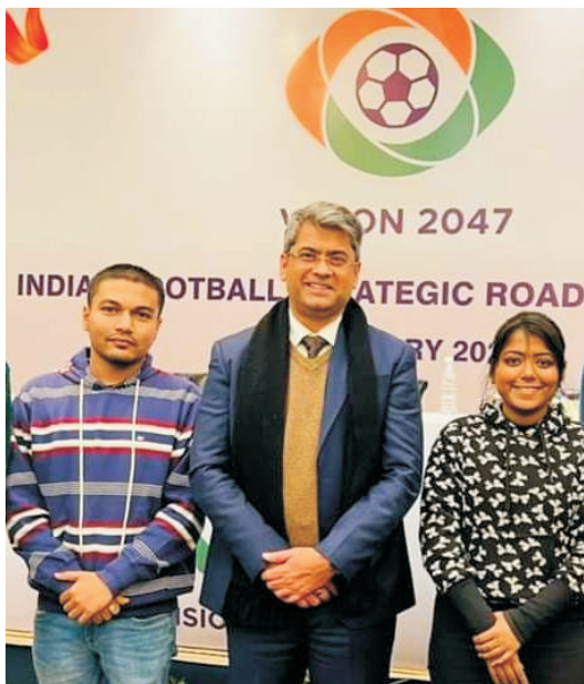
With the President of the All India Football Federation