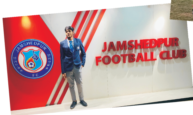
Our student at the Jamshedpur Football Club