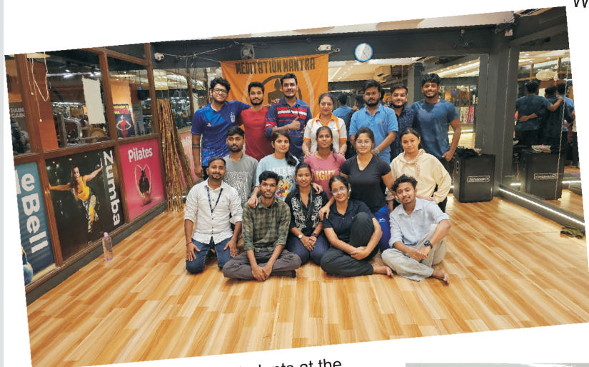
Sports Management students at the Mantra Health Club