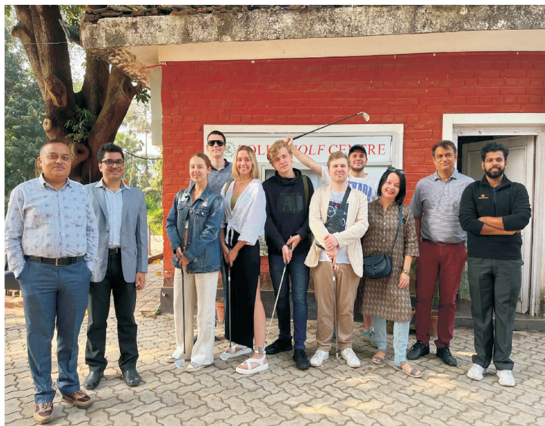
Venue Visit arranged by the Sports Management Department as a part of the Exchange Programme for the students of the Moscow State Linguistic University