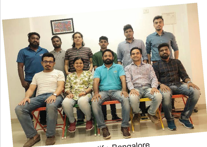
With Sportify, Bangalore