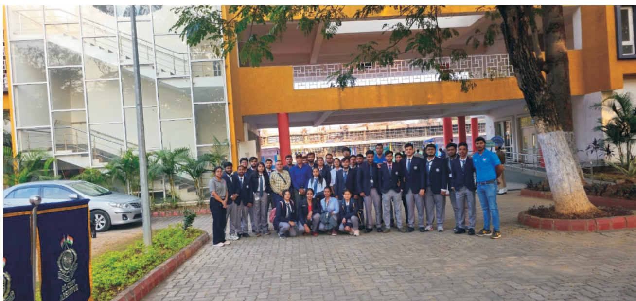
Students of -the Sports Manegement Course at the Naval Tata Hockey Academy

The course curriculum is comprehensive and is constantly upgraded to meet the needs of the industry. The most experienced and erudite faculty members, drawn from the fields of academics and the business of sports, are associated with the Sports Management Department. The course structure, efficient faculty members, ample on-field experience and a systematic process of evaluation have made the course unique. The course is a perfect combination of theory and practice.