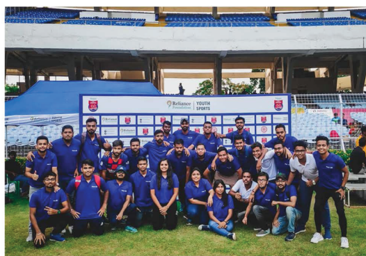
In an event of Reliance Foundation Youth Sports