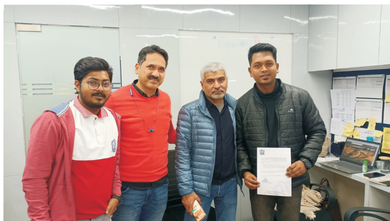
With Gallant Sports and Infra, Delhi