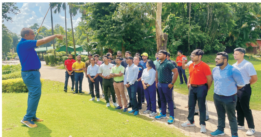
Students during venue visit