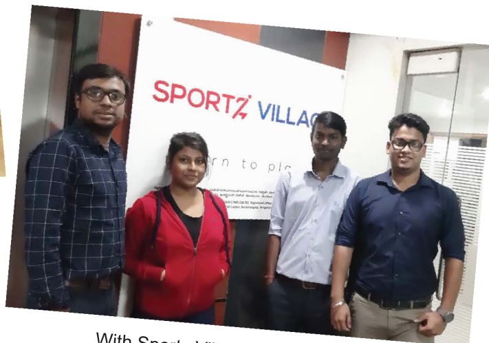
With Sportz Village, Bangalore