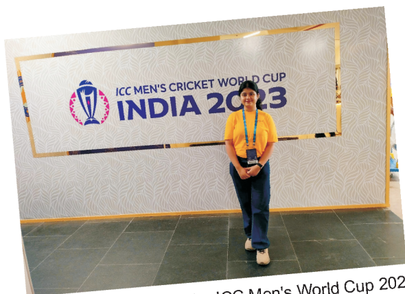
Our student working in the ICC Men's World Cup 2023