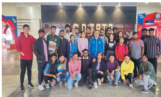
Students of the Sports Management Course at the Tata Steel Sports Complex, Jamshedpur