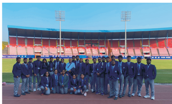
Students of the Sports Management Course at the JRD Tata Stadium, Jamshedpur