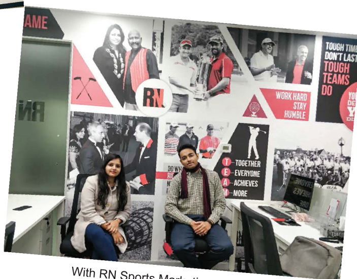
With RN Sports Marketing, Gurugram