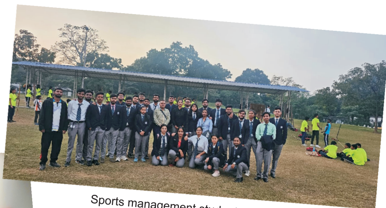
Sports management students at the Jamshedpur Archery Academy