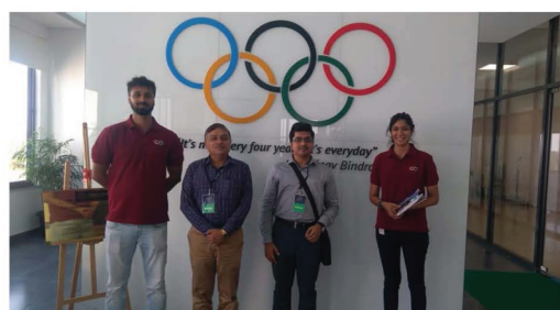
Faculty Members of the Sports Management Department at the Padukone-Dravid Centre for Sports Excellence, Bengaluru