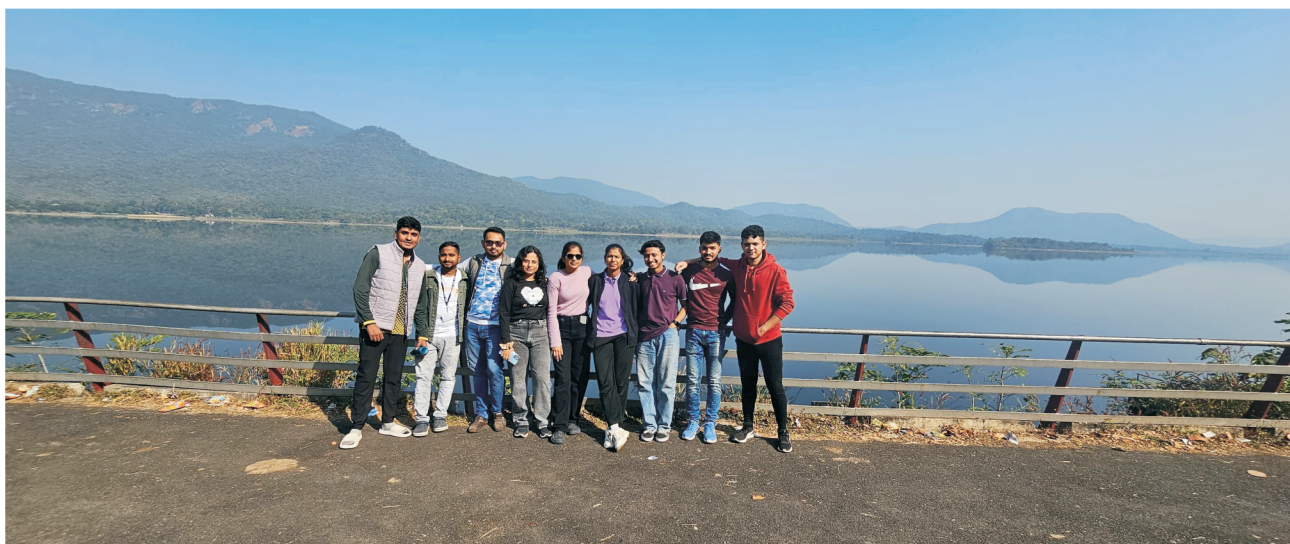
An excursion visit of the students at Dimna Lake Jharkhand during the period of Internship