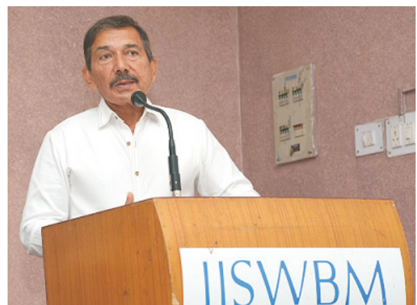
Shri Arun Lal, the former Chief Coach of the Bengal Cricket Team & former opener of the Indian Cricket team, inaugurating the Sports Management Course, (Session 2019-2020)