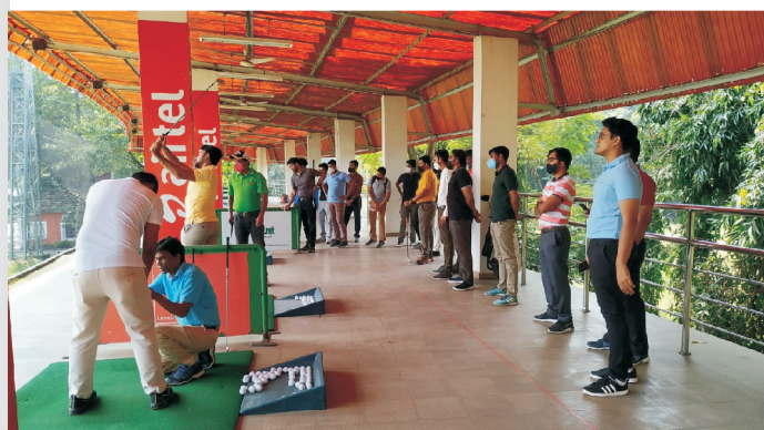
Students having a session on golf at the Tollygunge Club