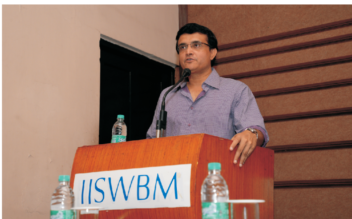
The legend of Indian cricket, Shri Saurav Ganguly, inaugurating the Sports Management Course for the Academic Session 2018-2019

Assistance is rendered to students in obtaining placement. The record of placement is exemplary and practically all the students have been suitably placed in India and abroad with reputed Sports Organisations, Sports Management Companies and other organisations operating in the field of sports.