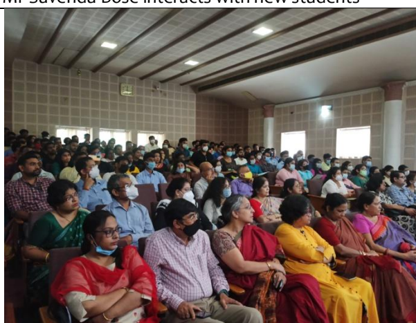
Faculty, Officer and Student at Inaugural Ceremony