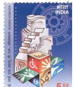
IISWBM Postage Stamp

India's first B-School, Indian Institute of Social Welfare and Business Management (IISWBM), is a name that weighs abundant in legacy. From the choicest alumni bandwagon to the grandeur of the building stature at the educational hub of Kolkata, the institute is stately in ways more than one and was constituted on 25th April, 1953. The Government of India, Department of Posts in recognition of 50 years of glorious existence of the first B-School in the country, released a Commemorative Postage Stamp on IISWBM, on 25th April 2004 in New Delhi. MBA (HRM) is ranked among the top 10 post graduate programmes in HRM in India and Google search highlights the institution as one of the top HRM colleges globally. MBA (HRM) got duly accredited by SHRM USA for quality of academic content in the year 2012. The year 2022 has witnessed 100% quality placements of the final year students.