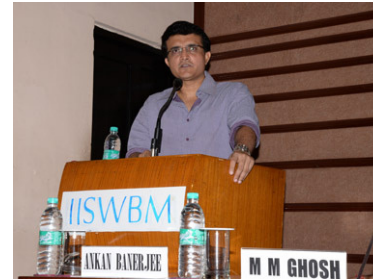
Mr. Sourav Ganguly at the Inauguration of Naval Tata Centre, IISWBM