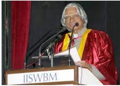
Hon'ble Dr. APJ Abdul Kalam, the then President of India at the Institute's Convocation in 2006