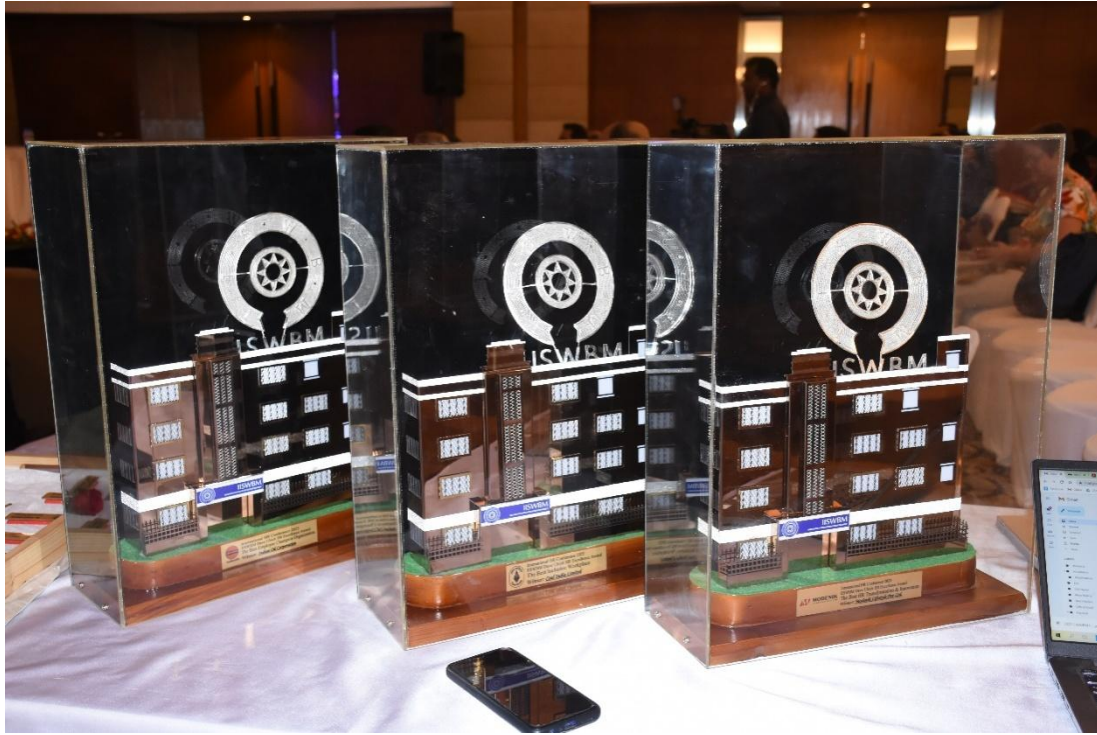
IISWBM-Dave Ulrich HR Excellence Awards (Silver logo, filigree work, Khimiji Cuttack)

Best HR Transformation and Innovation” and Coal India Ltd. for “The Best Inclusive Workplace” for their exceptional contribution towards these 3 categories of Excellence parameters in the HR field.