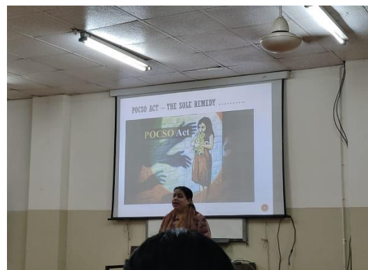
Talk on The POCSO Act