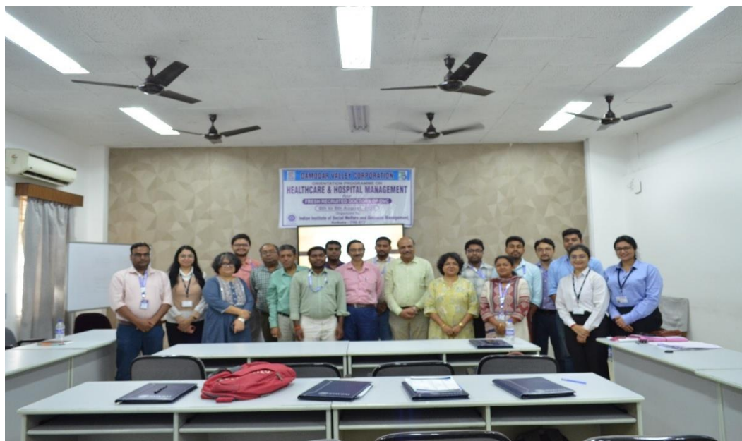
Valedictory Program held on August 8, 2025 at IISWBM