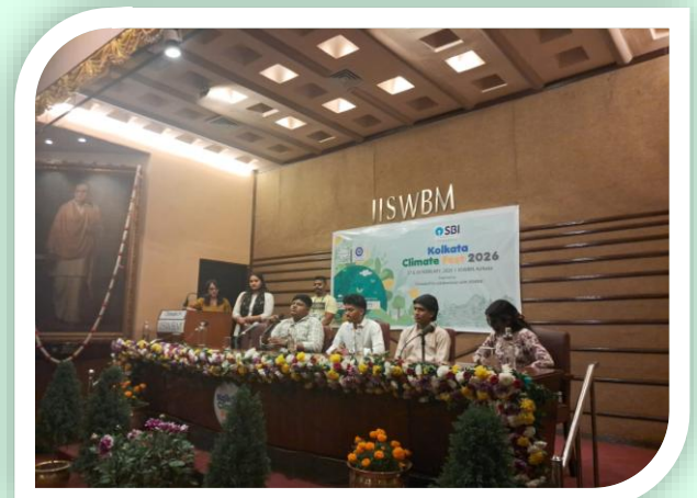
Fig 5. IISWBM feels proud to give an opportunity to Street Rangers, underprivileged youngsters who are mostly affected by the Climate Vulnerabilities