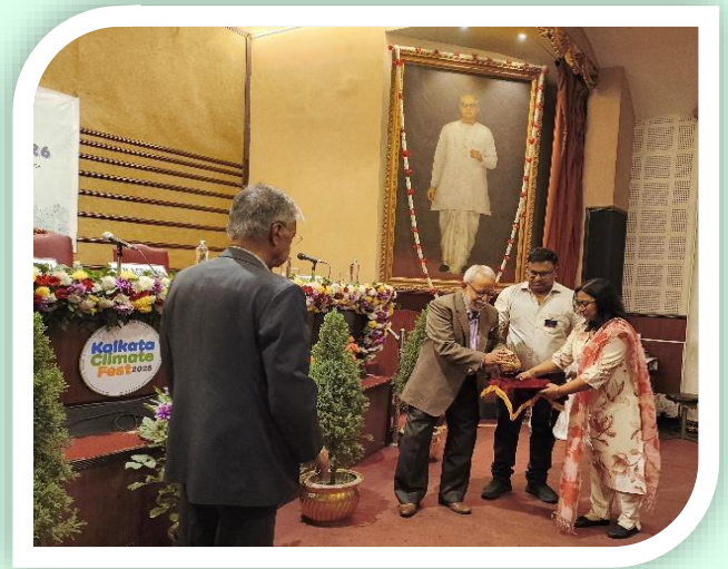
Fig 1. Inauguration Ceremony